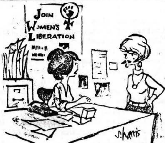
"Sorry, but transvestites can only be associate members."