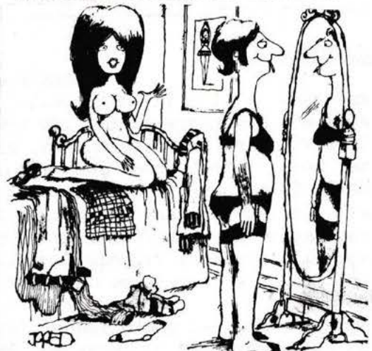
"Gee, Harold, when you said you wanted to get into my pants..."