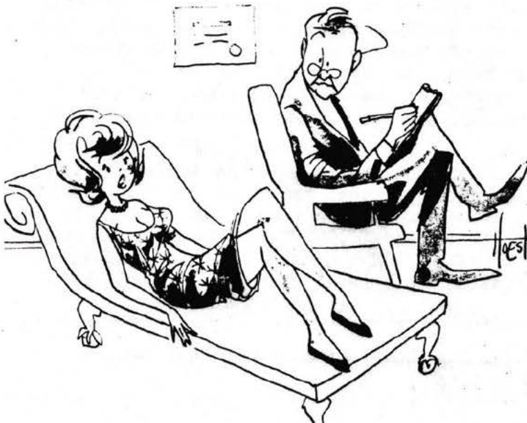
"It all started when I was assigned to the 'Decoy Squad' to impersonate a woman . . ."

AT LAST! " The Committee You Have When You Are Not Having A Committee! "