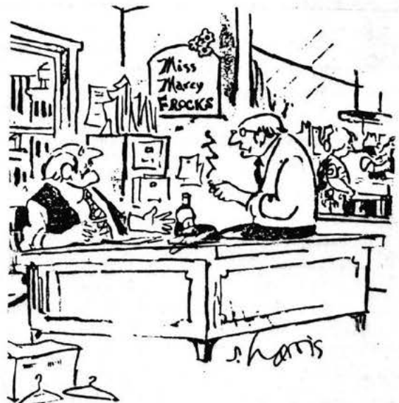
"Organdy party dresses at home, little black evening dresses at the office—as a transvestite, my son is a joke."