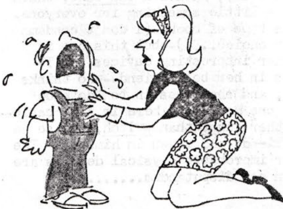
"I want a dress!"

Any present members in good standing who wish to get in touch with either of these two ladies can do so by writing via "Contact". New members will, of course, contact them direct. We are also working on some other regions and hope to have results very soon. These are namely, Central Pennsylvania, Oklahoma, Toronto, Canada and Tennessee.