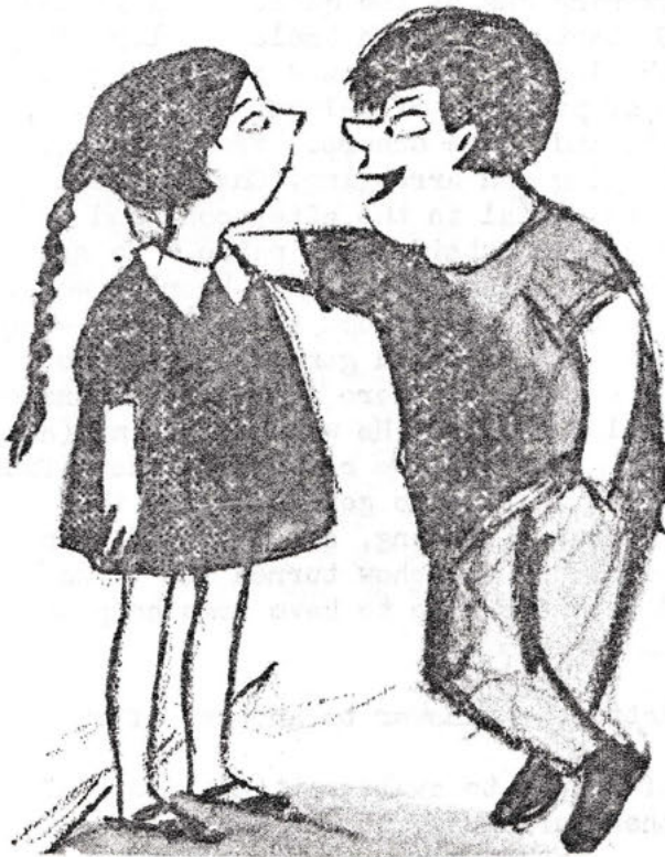
"If you're not a girl, what are you?"