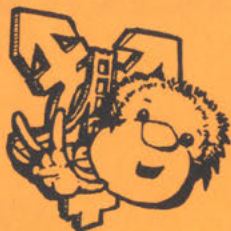
Oggie Wants You!

friends of friends, and any number of other acronyms to attend — all respectful folks are welcome! Gender is optional, of course.