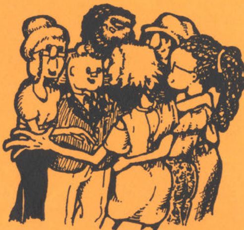
Thankfully, we don't usually "group hug."

A TransBay gathering is also not "pick up joint." We don't want folks to worry about individuals looking for a "hot time." There will be fun, and probably a touch of flirting here and there — but if your looking to meet your next lover, try somewhere else, please.