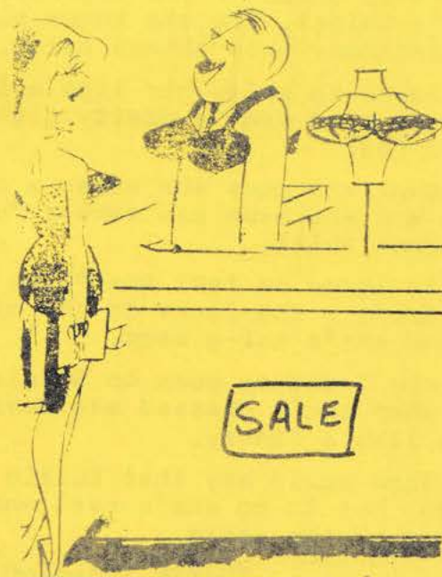
"Admit it, Miss . . . it's a beautiful bra!"