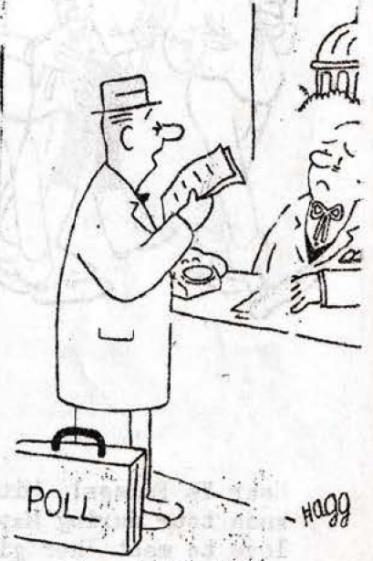
"Three out of five Senators 'dress-up' as a hobby."