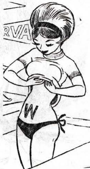
"That old college try isn't bad!"

We are running out of room for storage of back issues of the Femme Forum. If any of you ladies would like to get some good reading material at a reasonable cost, you might like to pick up some of the Forums that you have not received. If you would like to purchase a number of the Forums at 50¢ each, now is the time to do so. This price is less than our cost and includes postage, so it is a good deal for you gals. Just write down the numbers of the issues that you don't have and send it